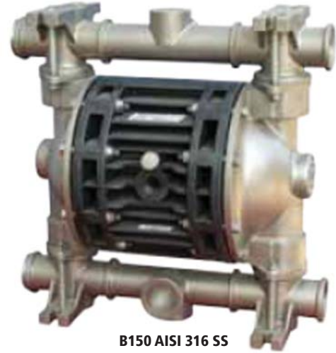
B150 AISI 316 SS

They are specifically designed for demanding applications with high humidity or in potentially explosive atmospheres (ATEX certification).