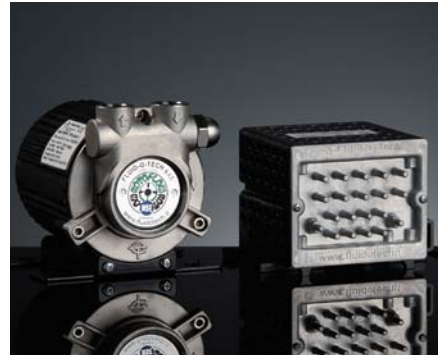
Model TMFR & Power Supply/Speed Controller