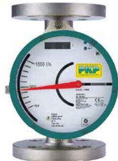
Variable Area Flow Transmitters