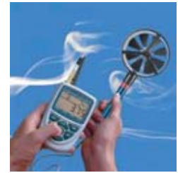
Portble & Bench Top Dataloggers