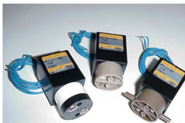
Inert Isolation Valves