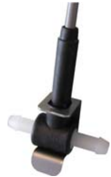
PVDF & PFA Low Flow Sensors