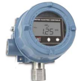
Pressure & Temperature Switches

FLOW PRESSURE LEVEL TEMPERATURE HUMIDITY ROTATIONAL SPEED INDICATORS, SWITCHES, TRANSMITTERS, CONTROLLERS, DATALOGGERS, VALVES, SPECIALTY PUMPS