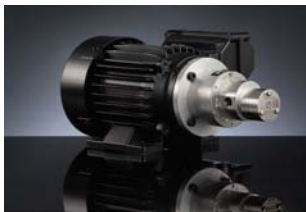
SS Gear Pumps