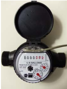
Totalizing Water Meters