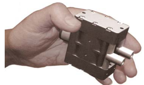
Diaphragm Air Pumps