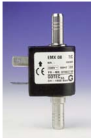
Solenoid Piston Pumps