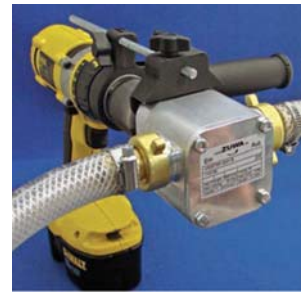
Flexible Impeller Transfer Pumps