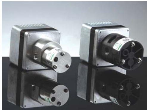
Variable Speed Gear Pumps