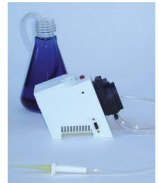
Bench Top Peristaltic Dispensing Pumps