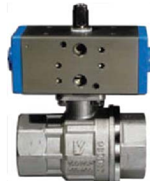
Pneumatic & Electric Actuated Valves